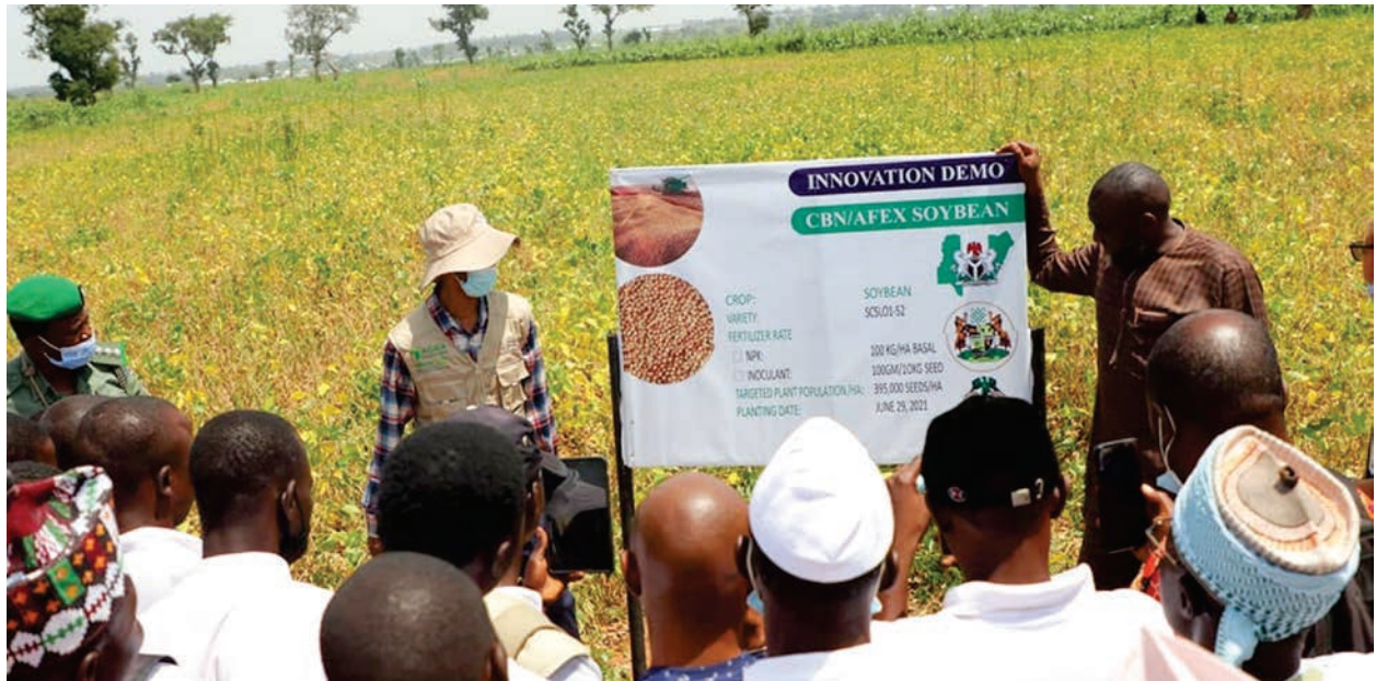
CBN hold field day to train farmers on best practices to increase productivity

Policy makers and agricultural practitioners have commended the Central Bank of Nigeria (CBN), for its various interventions aimed at transforming the nation's agricultural sector into an avenue for wealth creation.